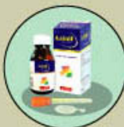
35 ml PFS