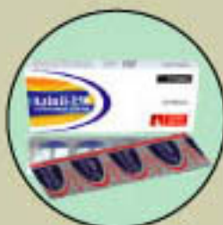
250 mg Tablet