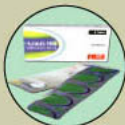
500 mg Tablet