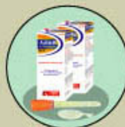
20 ml PFS